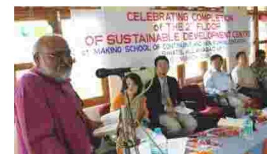
Vice Chancellor's message on the opening of Sustainable Development Training Center at Makino's School

It has been recognized that economic liberation has generated rapid economic growth, which has brought about a great change in all corners of rural India. Rough, rural roads have been paved. Communication facilities, especially mobile phones, are much developed in recent years. In fact, speed of the communication is dramatically getting faster and faster. It is much easier for us to have access to rural community by vehicles and to people by telephones.